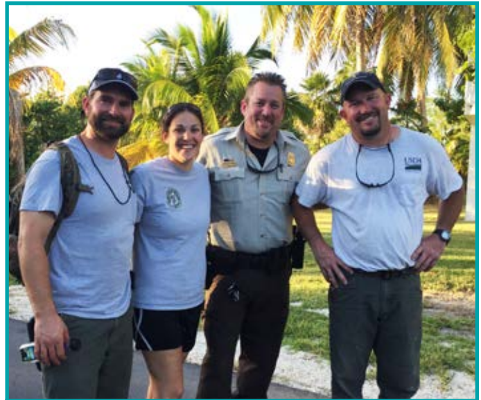
RESCUE TEAM (above): Four members of the excellent team that tranquilized, treated, and marked the Key deer #22 (below). US Department of Agriculture joined US Fish & Wildlife Service on Kyle Blvd on November 12th. Buck #22 has been reported doing well and chasing does.

You can always assist by being our eyes and ears in the field, and please report anything suspicious to the Key Deer Hotline: (888) 404-3922 x7 . We have Key deer hotline business cards available if you'd like some to give out to your neighbors, and as always, we welcome all residents and visitors to our Key Deer Refuge Visitor Center. Feel free to stop by with any questions.