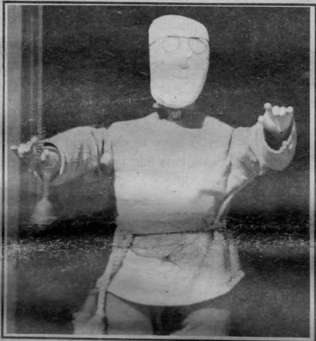
This manikin was not assembled by a human... see story Page 3 or so . . .

Twentieth Century Satan Travels the Globe on Power Lines